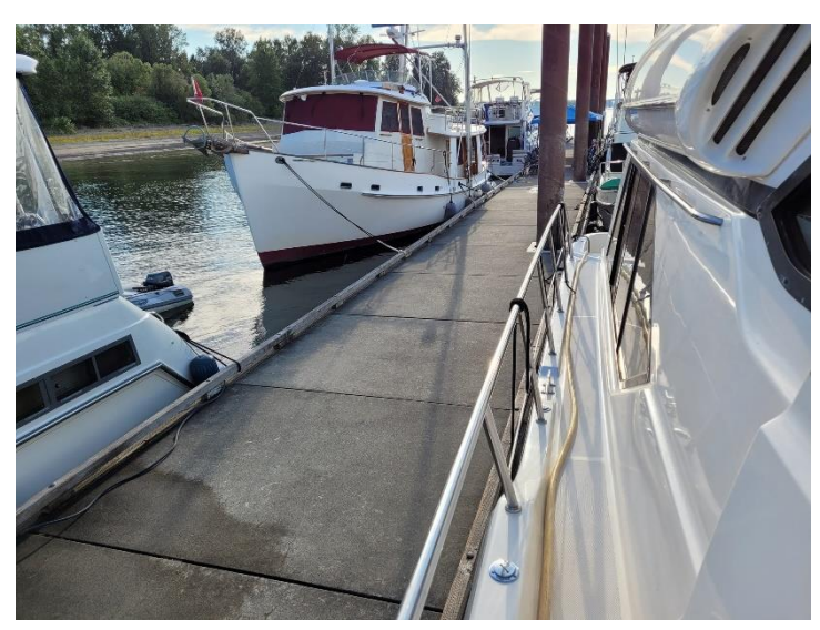
August 18^{th} - 20^{th} – Sandy Island -Tropical Cruise

August 4<sup>th</sup> - 6<sup>th</sup> - Schwitter Landing